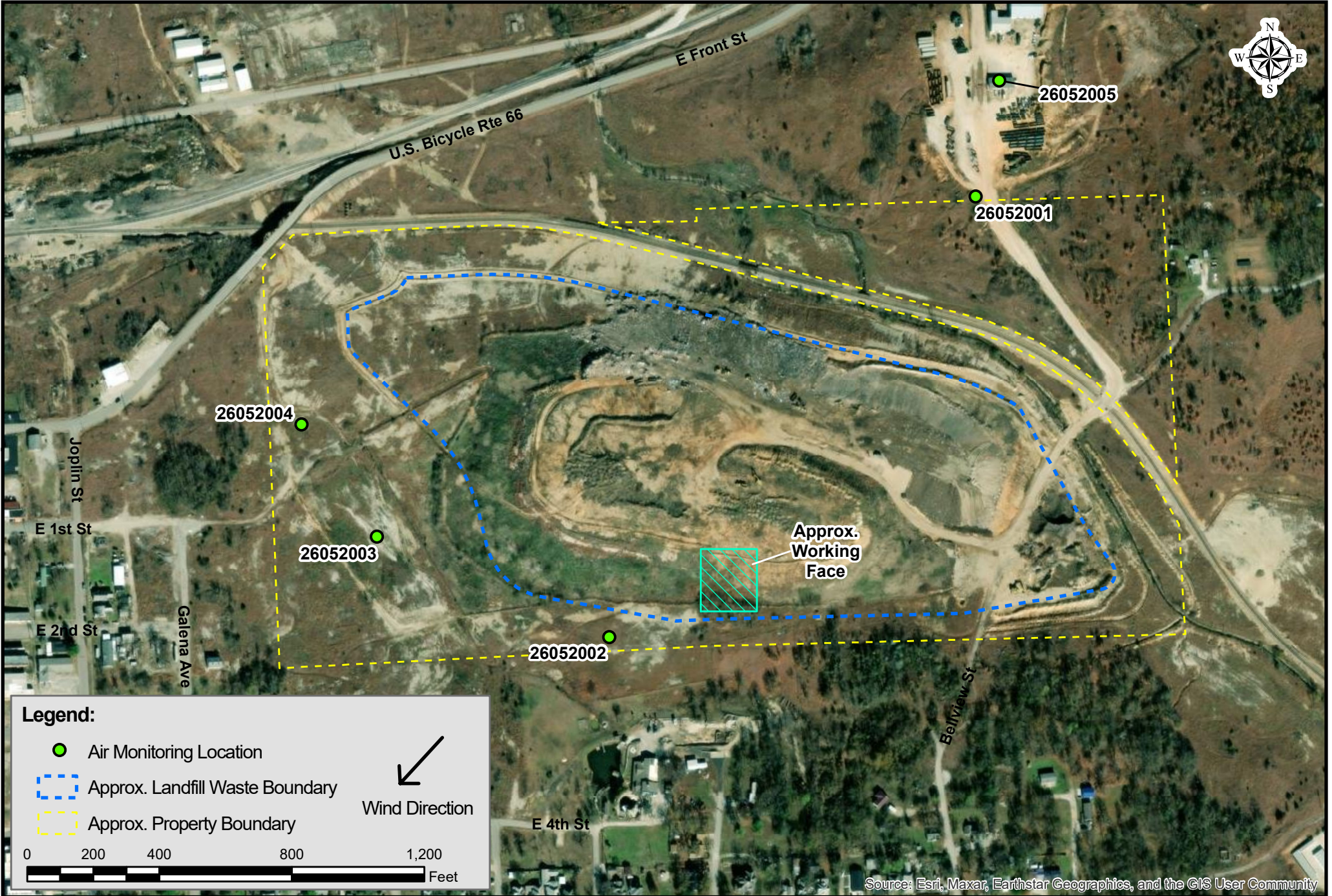
FIGURE 1 AMBIENT AIR MONITORING JORDAN DISPOSAL LANDFILL AIR MONITORING LOCATIONS 5.20.26